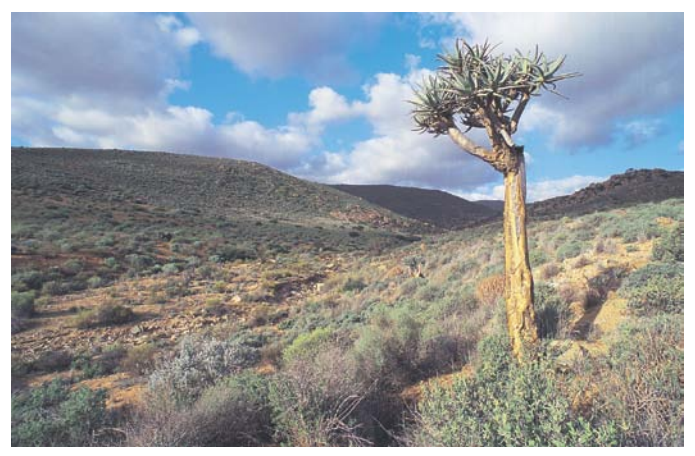
Figure 4: Namaqua National Park (SANBI, 2010).

Systematic biodiversity planning has provided a powerful platform for this work, with a key intervention being the production of Biodiversity Sector Plans. In some provinces and districts there has been significant progress in making the transition from having the plans in place to actually implementing them on the ground, resulting in the real integration of biodiversity and climate change adaptation priorities into the policies, programs and day-to-day work of other sectors. Implementation has been possible in these cases because of three key factors – the availability of biodiversity information (with recent products incorporating climate change) both online through Biodiversity-GIS and from the South African National Biodiversity Institute and conservation agency staff, the availability of technical support and training by the South African National Biodiversity Institute and conservation agency staff, and the existence of champions within these provinces and districts.