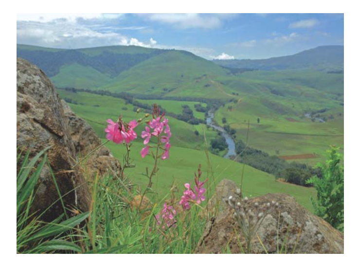
Figure 3: Umgano community stewardship site, KwaZulu-Natal province, South Africa (SANBI, 2010).

recognition of the role an expanded protected area network can play in climate change mitigation and adaptation, and hence highlighting the need for (i) having more, larger protected areas; (ii) connecting protected areas with natural corridors in the broader landscape; and (iii) focusing some management actions inside protected areas on resilience, adaptation and mitigation needs (Dudley et al. , 2010).